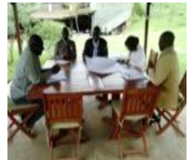
OF staff attending USG compliance training

The OF board also participated in a 2 day orientation aimed to introduce the CSOs on