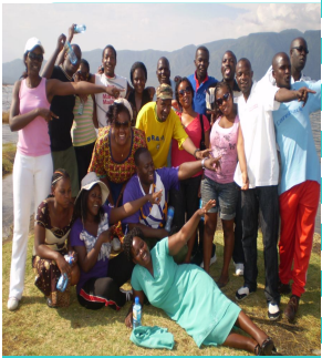
OF staff at the Lake Bogoria Hot Springs